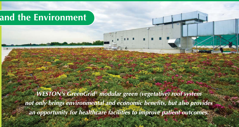
WESTON's GreenGrid® modular green (vegetative) roof system not only brings environmental and economic benefits, but also provides an opportunity for healthcare facilities to improve patient outcomes.

Healthcare facilities around the world are becoming increasingly aware of the benefits of incorporating sustainability into their operations: Enhanced sustainability provides opportunities to lessen a facility's environmental footprint, strengthen community relationships, and reduce costs. A more sustainable work environment also enhances quality of life for employees and can reduce staff turnover and improve morale and productivity. However, central to the mission of healthcare facilities—whether private, public, or non-profit—are the beneficial effects sustainability can have on patient outcomes. One specific component of a sustainability program with measurable benefits for the environment and patients is the use of green roofs to create therapeutic or healing gardens.