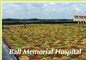
Ball Memorial Hospital