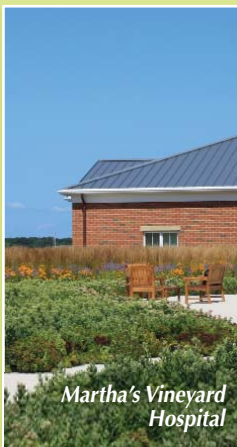
Martha's Vineyard Hospital