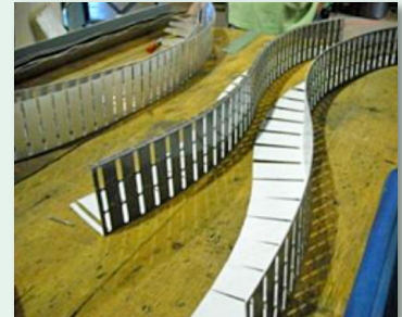
Flexible edge for curved shapes