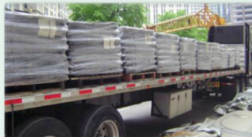
Standard flatbed trailer ready for unloading