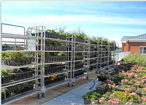
Standard intensive modules ready for installation