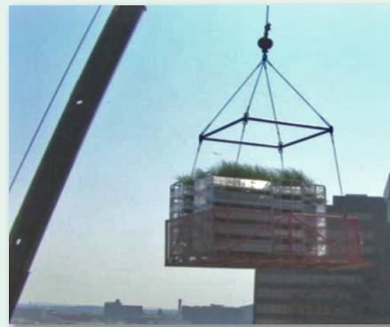
When hoisting by crane a lift pan should be used, especially with racks. NEVER hoist racks by their frames