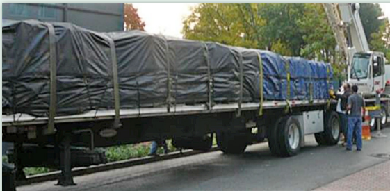
Standard flatbed trailer on arrival

IF MORE THAN 5% OF PALLETS ARE NOT RETURNED A $10 PER PALLET REPLACEMENT FEE WILL APPLY. LOST OR DAMAGED RACKS WILL INCUR A REPLACEMENT FEE OF $950 EACH.