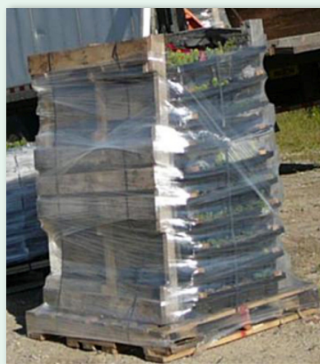
Standard half pallet on box truck