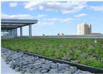
Painted steel and gravel trim