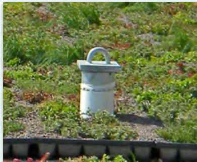
Anchor through module bottom