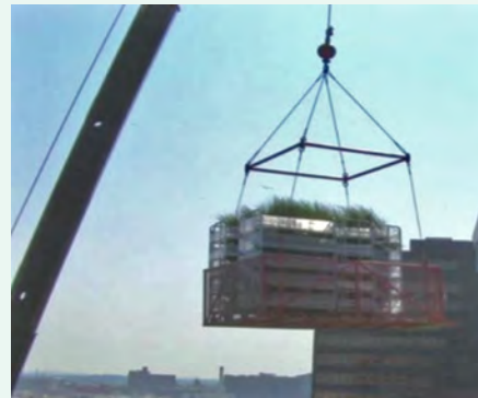
When hoisting by crane a lift pan should be used, especially with racks. NEVER hoist racks by their frames