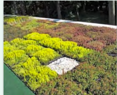
Full module-sized void space left around penetration and filled