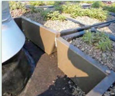
Modules cut and flashed to fit