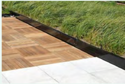
Painted steel trim with Ipe and concrete pavers on pedestals