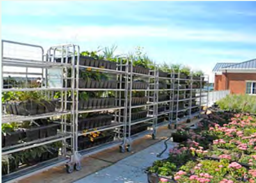
Standard intensive modules ready for installation