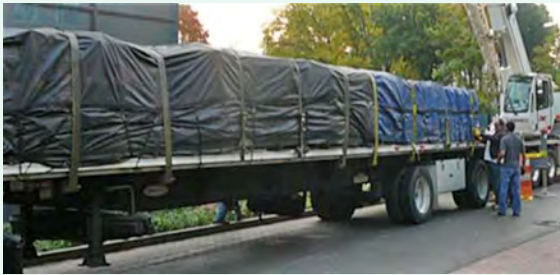
Standard flatbed trailer on arrival

IF MORE THAN 5% OF PALLETS ARE NOT RETURNED A $10 PER PALLET REPLACEMENT FEE WILL APPLY. LOST OR DAMAGED RACKS WILL INCUR A REPLACEMENT FEE OF $950 EACH.