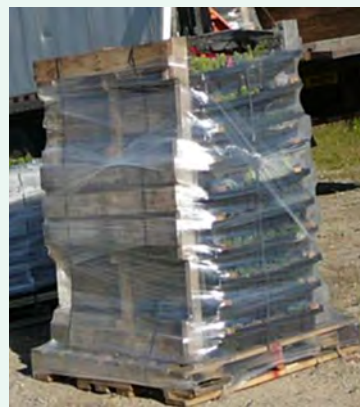
Standard half pallet on box truck