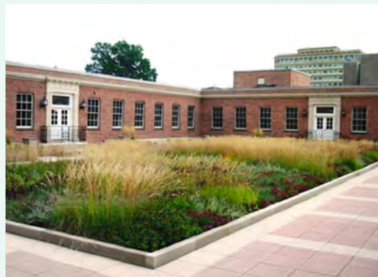
Intensive GreenGrid with concrete curb and concrete pavers on pedestals