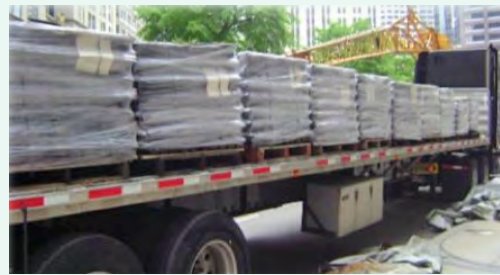
Standard flatbed trailer ready for unloading