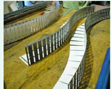
Flexible edge for curved shapes