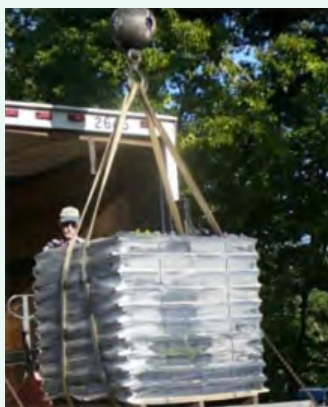
Standard full pallet on box truck

A 53-foot enclosed trailer truck, containing up to thirty racks (50" w x 30" d x 84" h). Each rack will contain five 2' x 4' size or ten 2' x 2' size modules. Maximum capacity of 1,240 sf per truck.