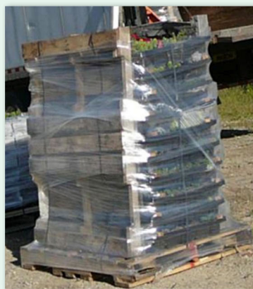
Standard half pallet on box truck