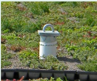
Anchor through module bottom