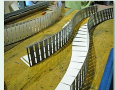
Flexible edge for curved shapes