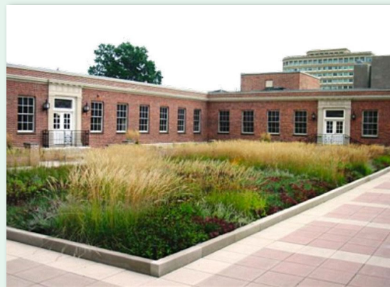
Intensive GreenGrid with concrete curb and concrete pavers on pedestals