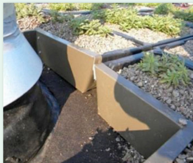
Modules cut and flashed to fit