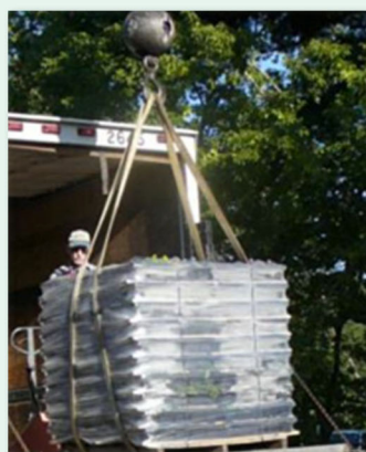
Standard full pallet on box truck

A 53-foot enclosed trailer truck, containing up to thirty racks (50"w x 30"d x 84" h). Each rack will contain ten 2'x2' size modules. Maximum capacity of 1,240 sf per truck.