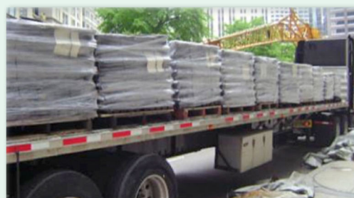
Standard flatbed trailer ready for unloading