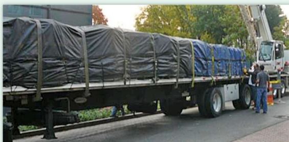
Standard flatbed trailer on arrival

IF MORE THAN 5% OF PALLETS ARE NOT RETURNED A $10 PER PALLET REPLACEMENT FEE WILL APPLY. LOST OR DAMAGED RACKS WILL INCUR A REPLACEMENT FEE OF $950 EACH.