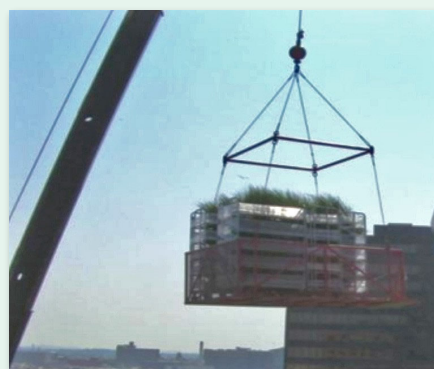
When hoisting by crane a lift pan should be used, especially with racks. NEVER hoist racks by their frames