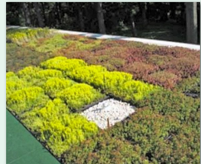
Full module-sized void space left around penetration and filled