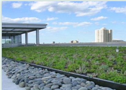
Painted steel and gravel trim