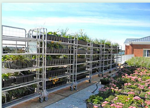
Standard intensive modules ready for installation