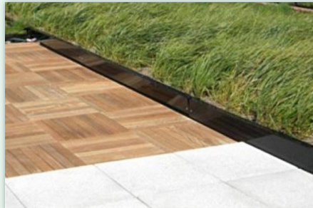
Painted steel trim with Ipe and concrete pavers on pedestals