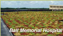
Ball Memorial Hospital